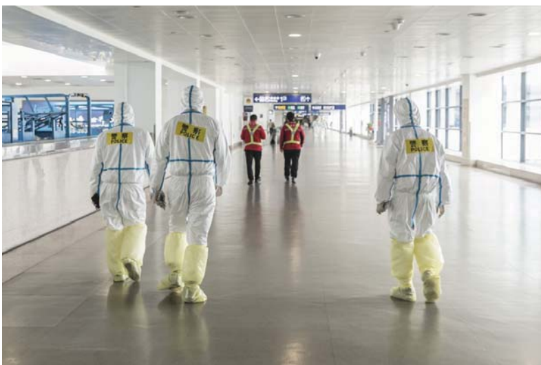
Airport employees wear full body protective suits at Pudong International Airport in Shanghai on March 28.