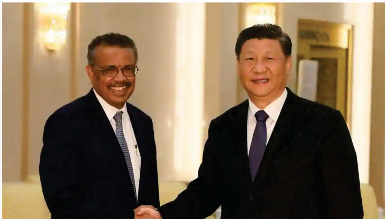
Tedros Adhanom, WHO director general has been accused of pushing the Chinese agenda of playing down the coronavirus outbreak in the initial stages. Seen in this photo, with President Xi Jinping

India has backed calls to identify how the Sars-CoV-2 virus that causes Covid-19 was transmitted from animals to humans and conduct an 'impartial' evaluation of the World Health Organisation's response to the pandemic, according to a draft resolution proposed for the WHO's annual meet beginning tomorrow.